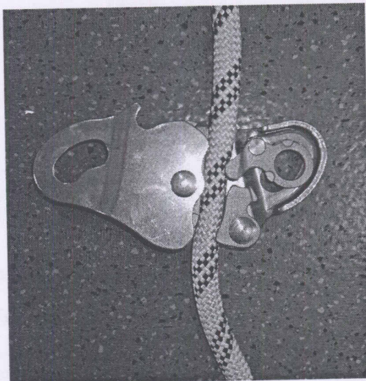
(marking not shown)